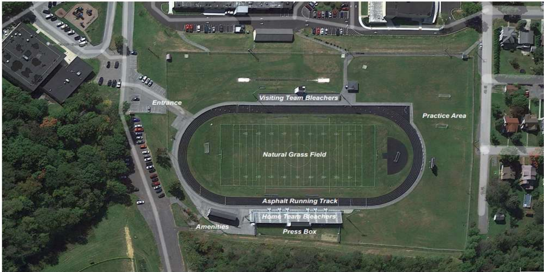
Penn Cambria High School Stadium - Current Satellite Image