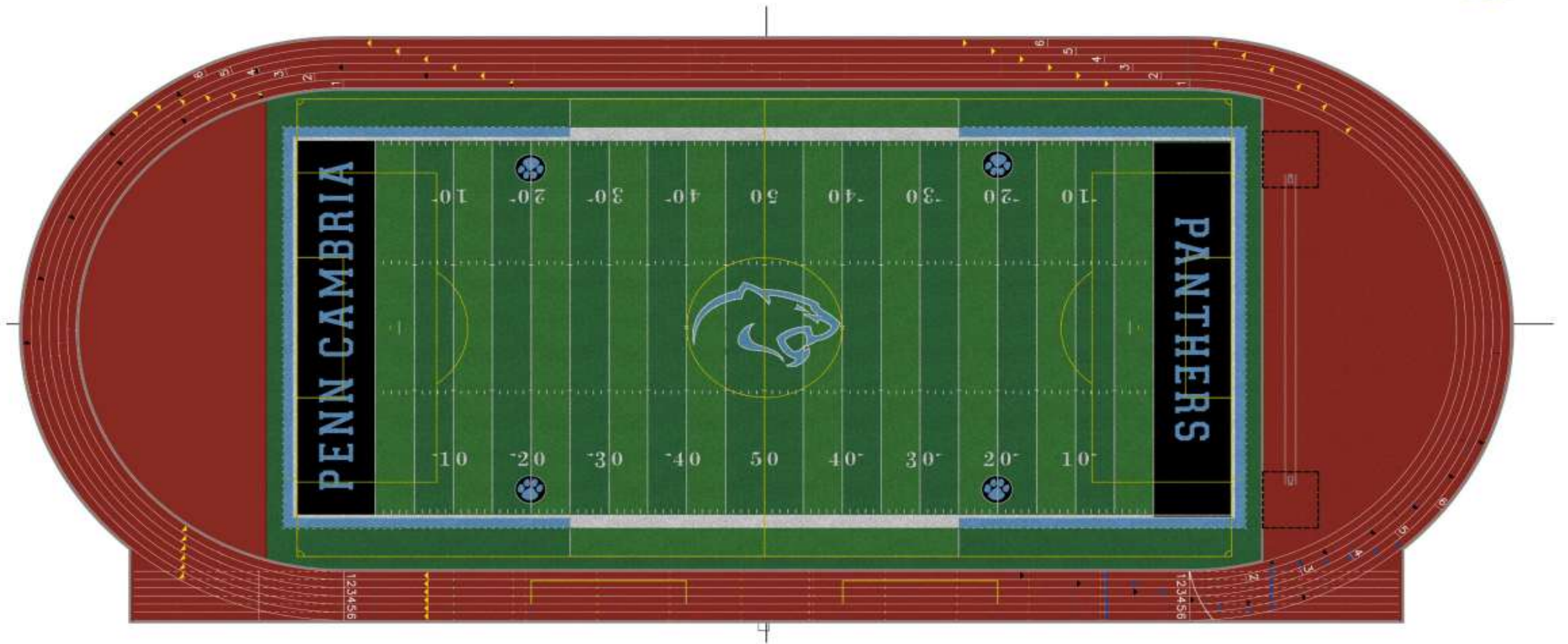
New Artificial Turf Proposed Field Graphics