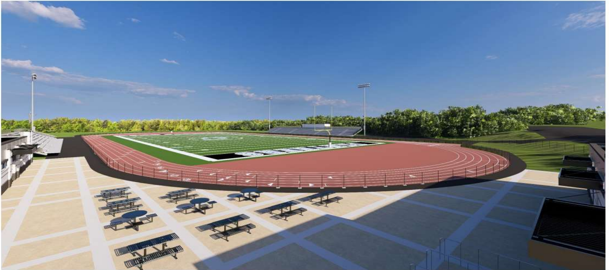
Field and Plaza view from inside Entrance Gates