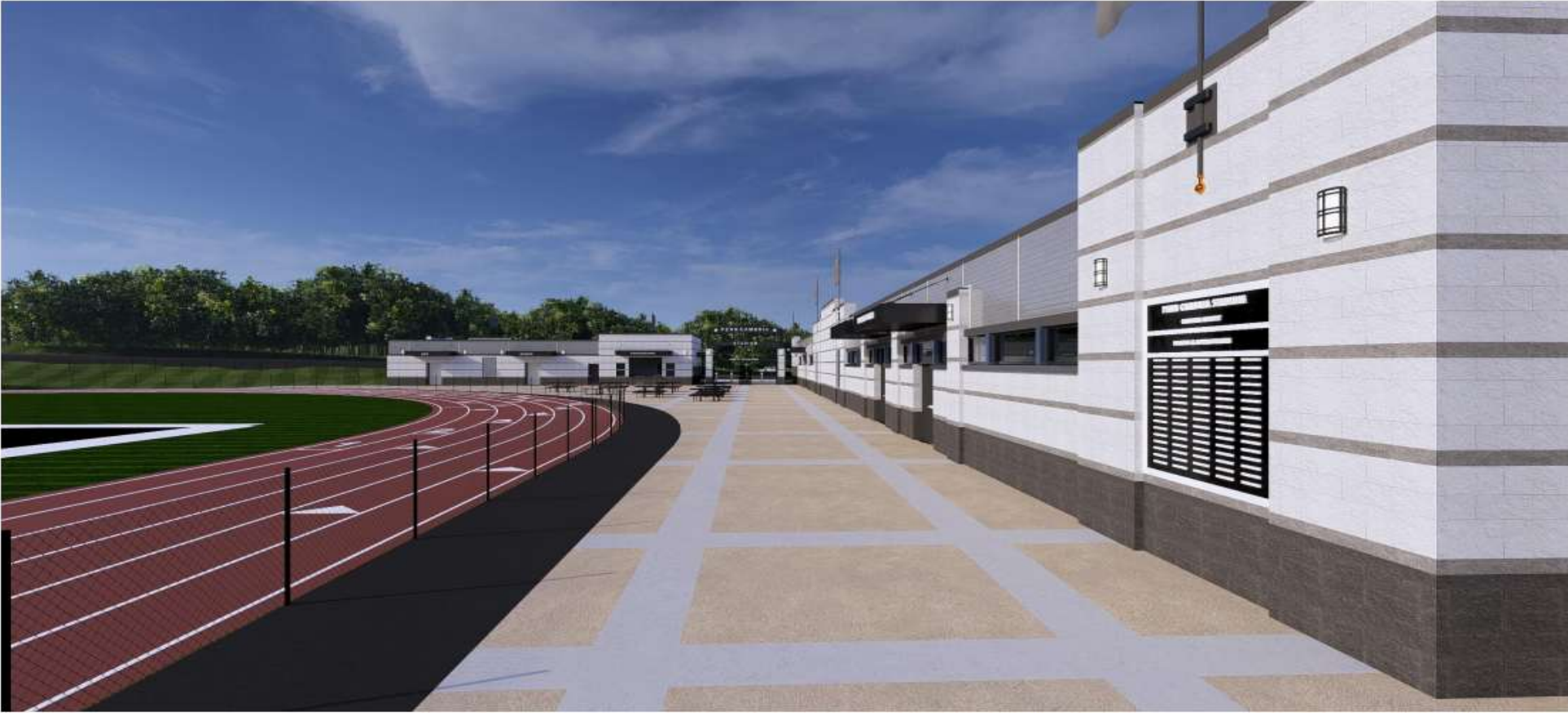
View along Fieldhouse looking toward Entrance Gates and Amenities Building