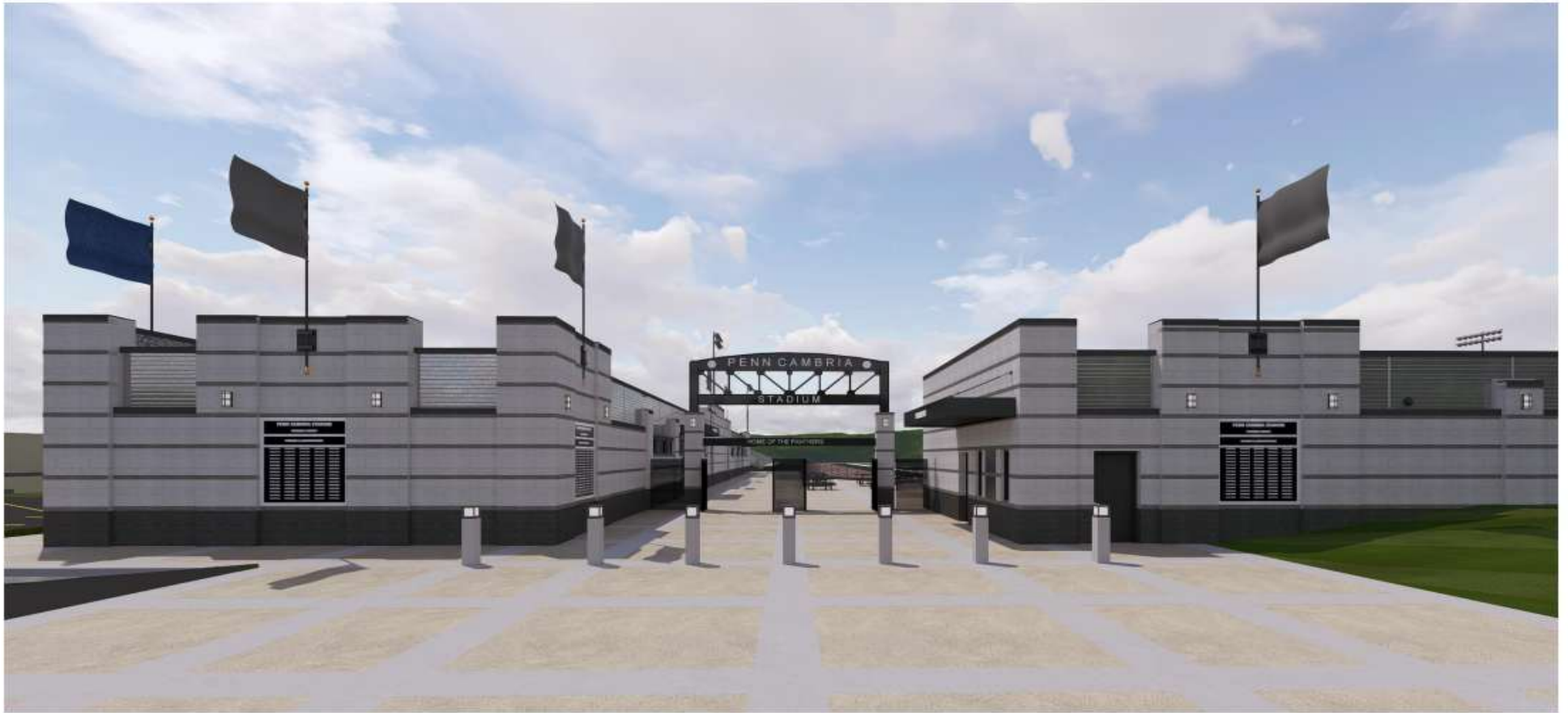
Entrance Gates and Ticket Booth view looking toward New Stadium