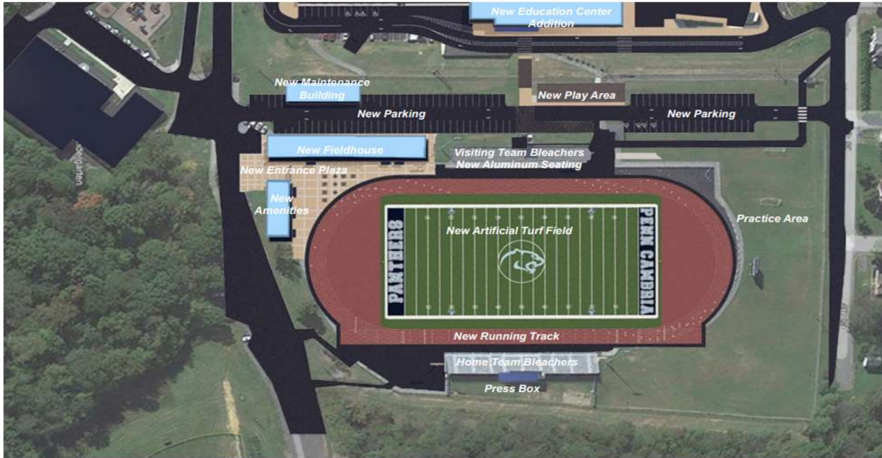
Penn Cambria High School Stadium – Proposed Improvements