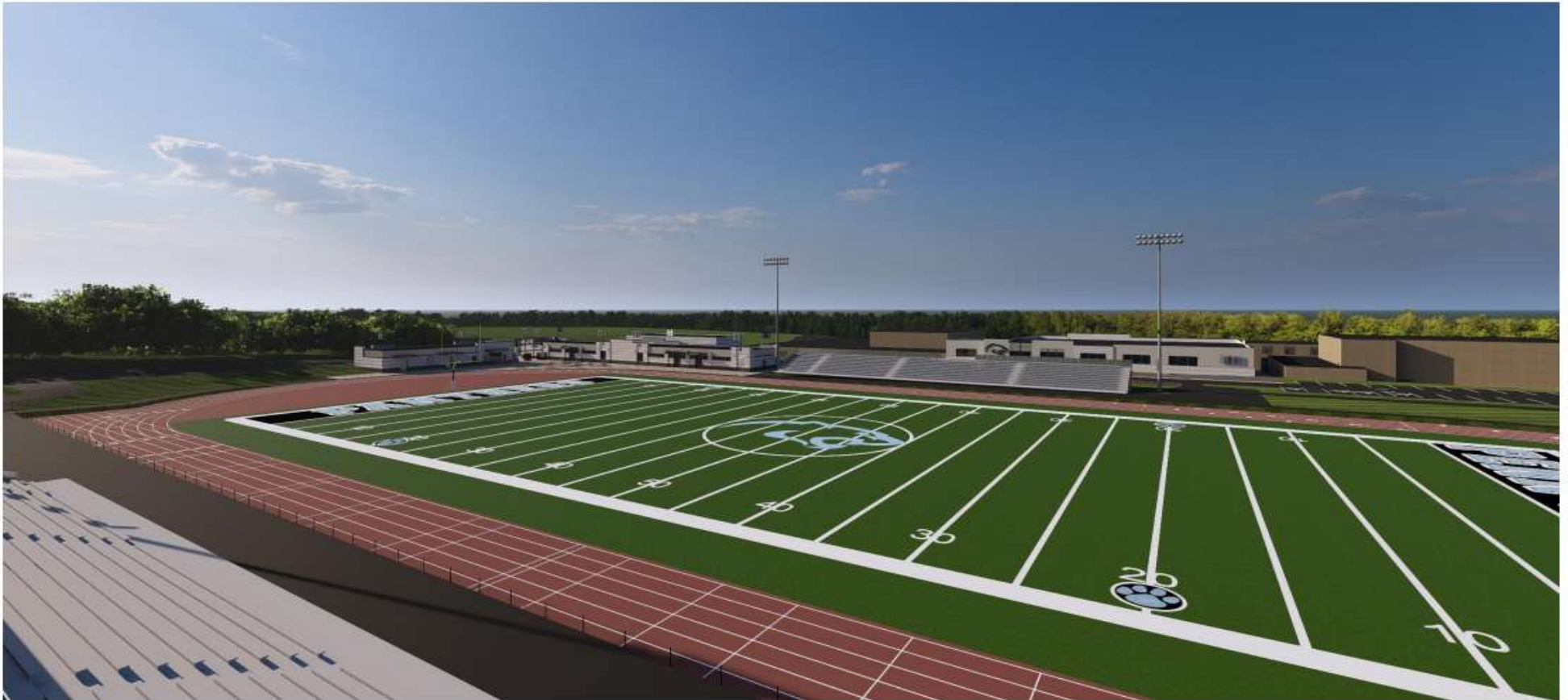
Field View From Home Side Bleachers