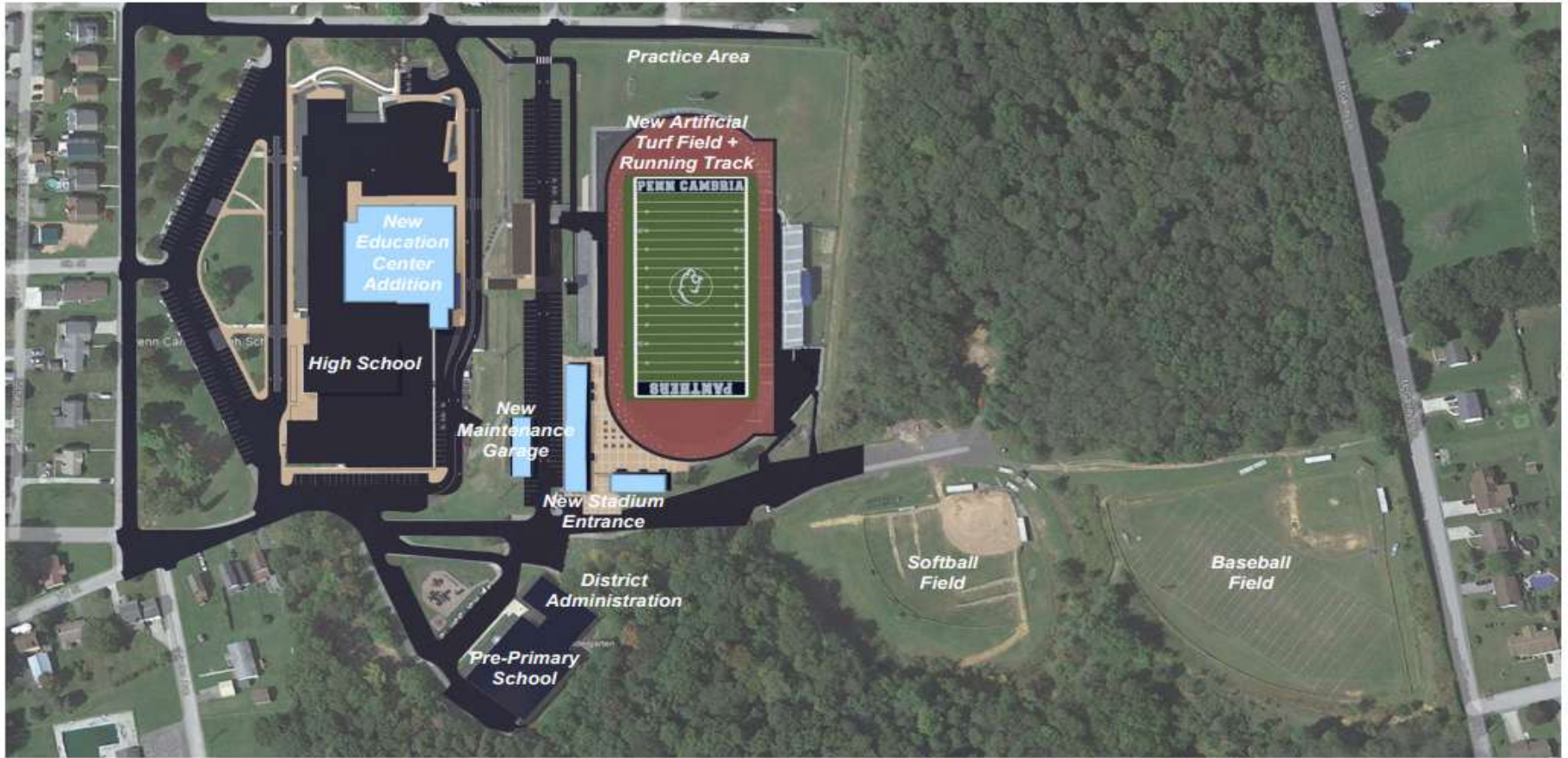
Penn Cambria High School Campus – Proposed Master Plan