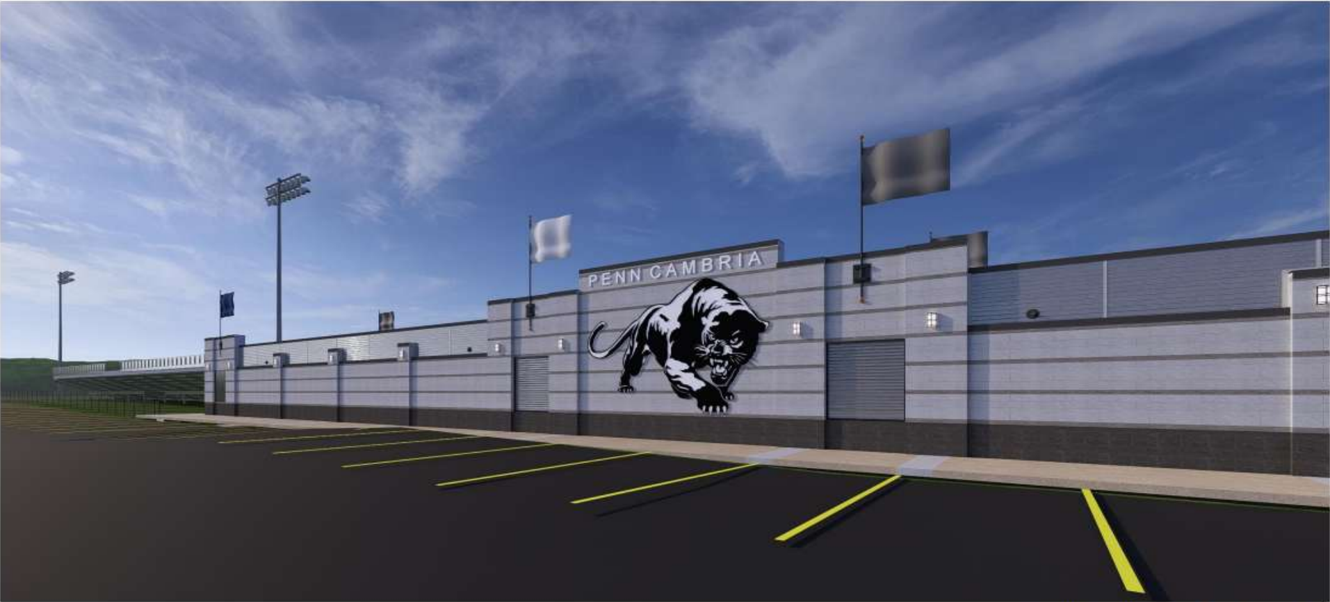
Fieldhouse view from New Parking Area