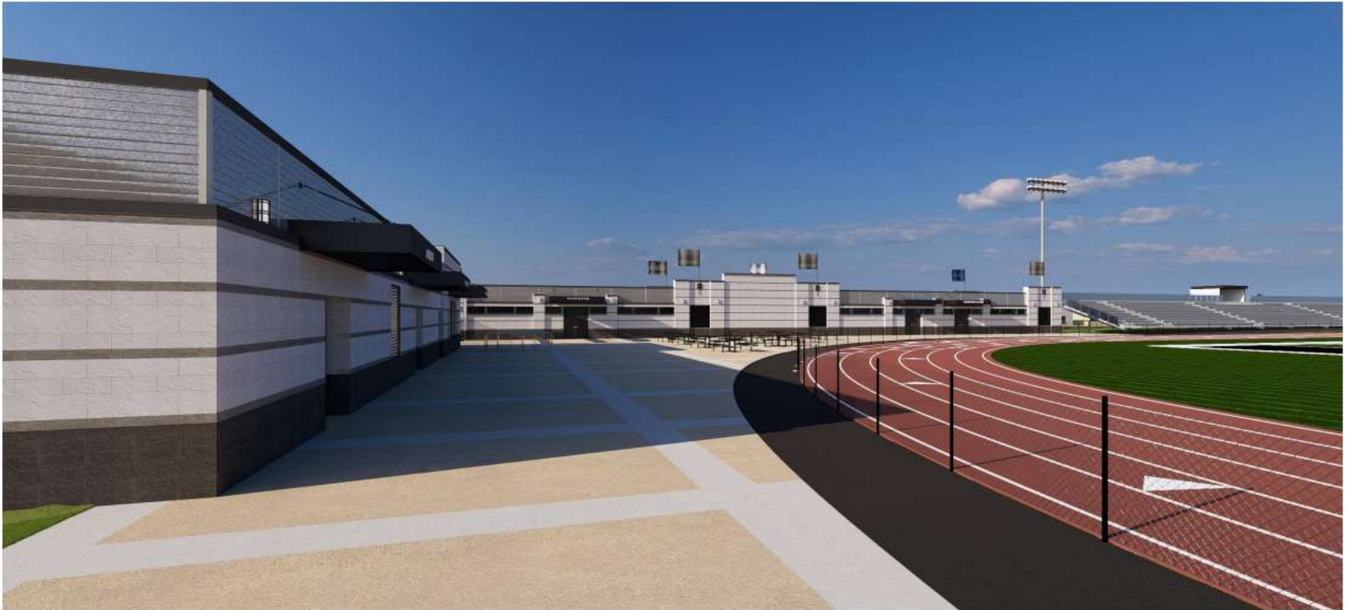
Amenities Building and Fieldhouse view from Plaza